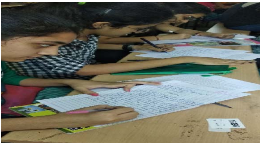
Good Handwriting Competition Dt.: 29/10/2018