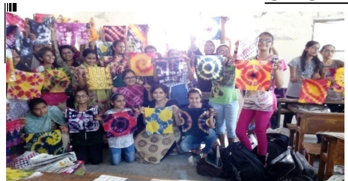
WORKSHOP ON HOBBY IDEA