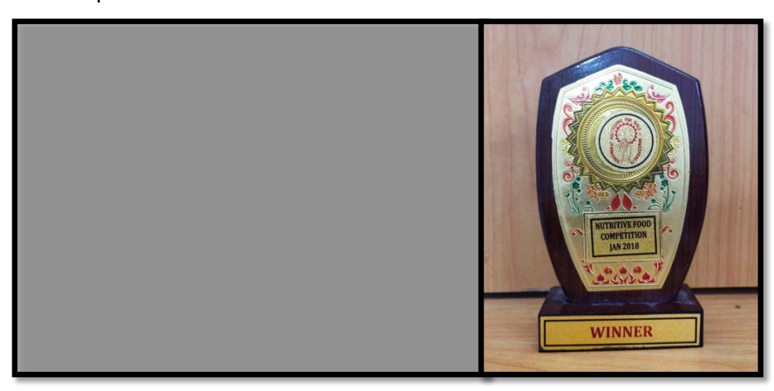
Food Competition Dt.: 19/01/2018

Food Competition "Health on Plate" Winner is "Krina Panchal"