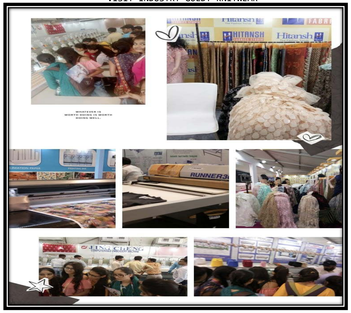
Visit to Garment fair at # G.M.D.C. Ground. Ahmedabad