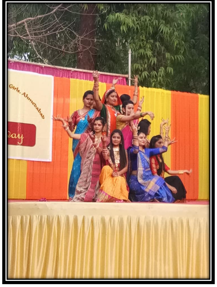
"SAMANVAY- A Fashion Show"