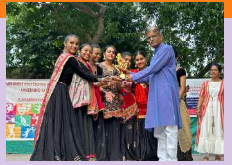
Gopi Raas is celebrated every year in navartri. Students all departments participated in garba competition followed by "Gopi Raas" in campus.