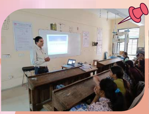
Expert Lecture on Concrete Mix Design