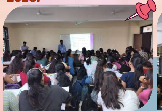
Expert Lecture on Machine Learning

Insights of Seminars, Workshops and Industrial visits were conducted on Recent Trends and Technologies by all departments during year 2023.