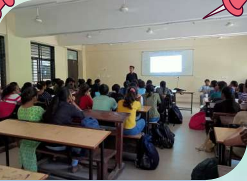
Expert Lecture on Machine Learning