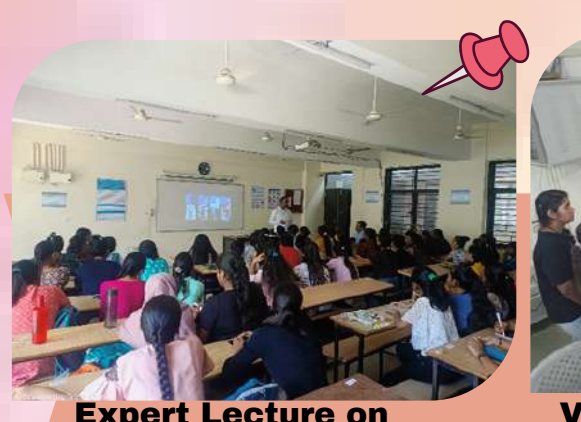
Expert Lecture on Medical Imagining