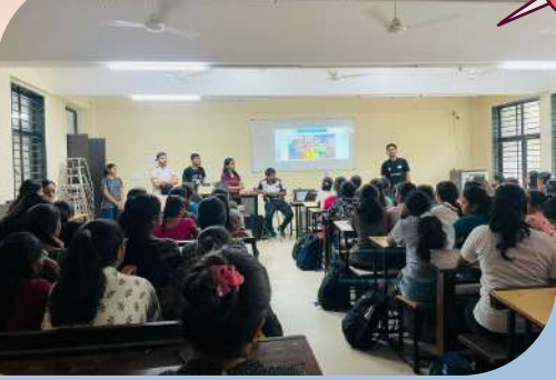
Expert Lecture on Robotics Computer Engineering