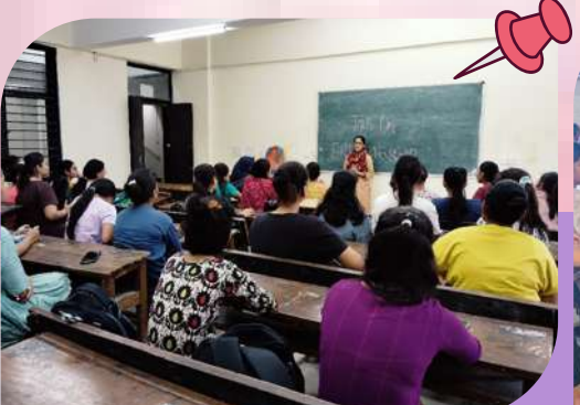
Expert Lecture on Enterpreneurship