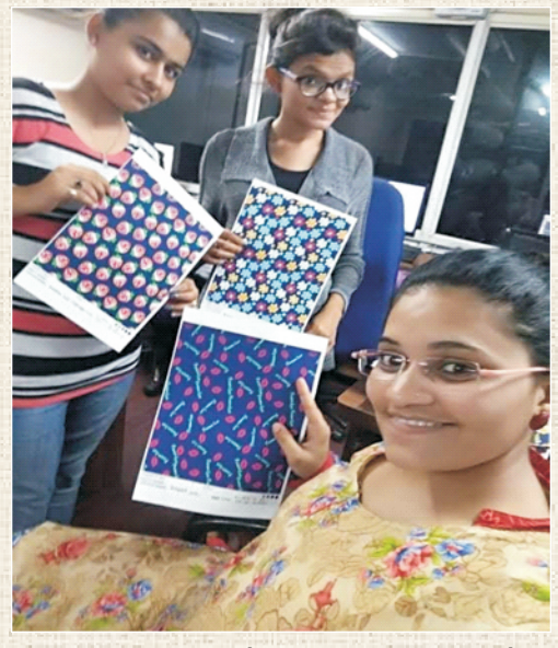
Design Done By Student Which Print On Cloth At Industry (July 2017)