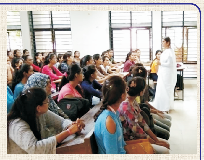
Celebration Of Raksha Bandhan With Brahmakumari Sisters