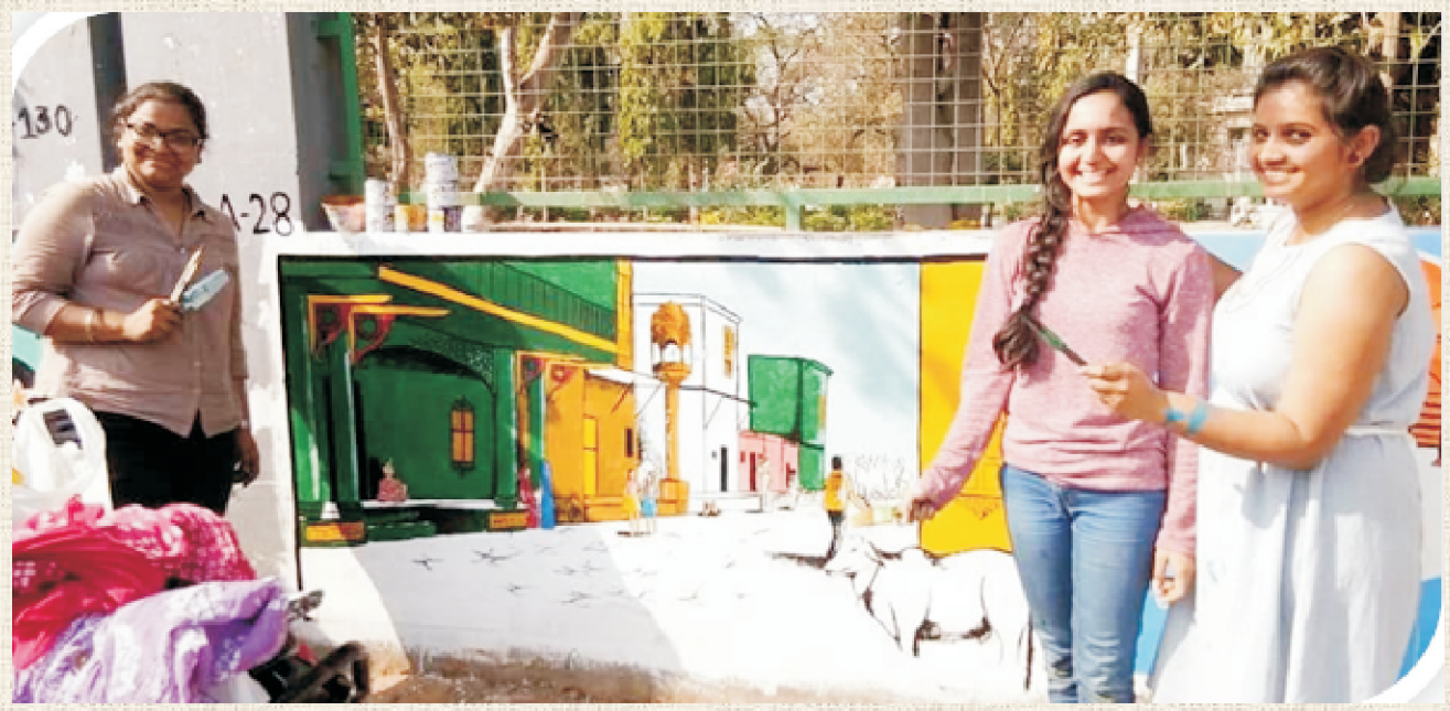
Students participated in wall painting under" Rangamez" (Nov. 2017)