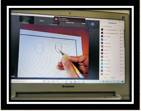
Webinar by Hobby Idea Liquid Embroidery technique Toatal participants :55