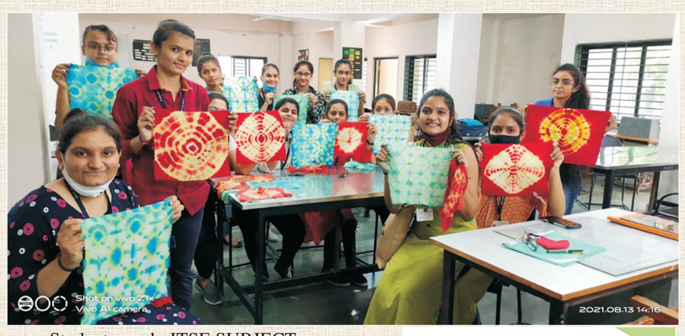
Students work: ITSE SUBJECT