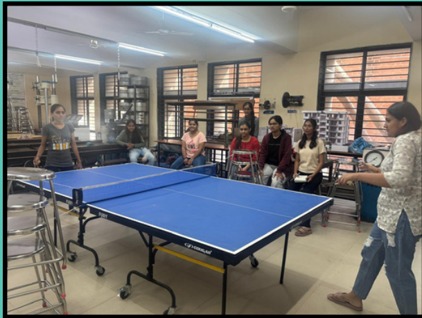
Table Tennis, also known as Ping Pong, is a high-speed sport that requires lightning-fast reflexes, strategic thinking, and precision. Played on a small table with a lightweight ball and paddles, it is one of the most exciting and accessible racket sports in the world. The number of participants are 09 .